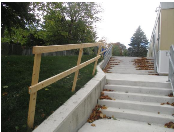
Photo #7- Temporary wooden railing along stairs are to be removed and disposed off site and photo is to be submitted to our office for review.