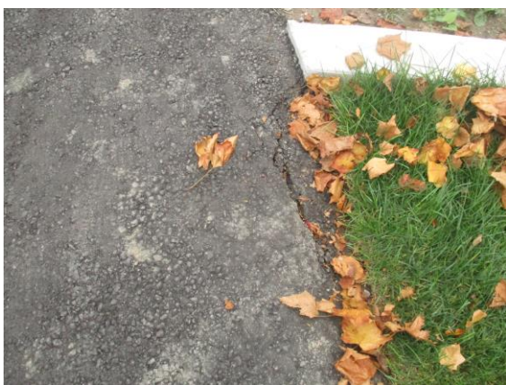
Photo #5- Asphalt surface segregation and cracked/settlement was noted at locations 3 and 4, asphalt areas are to be repaired, photos are to be submitted to our office after repair of asphalt at both locations.