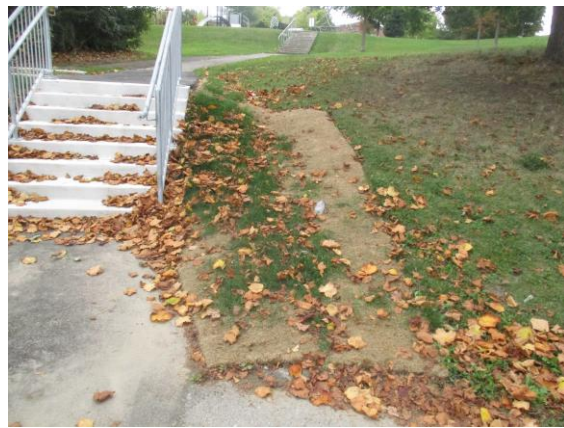
Photo #8- Damaged sods adjacent to stairs at location 4 are to be replaced and photos are to be submitted to our office after repair of sods.