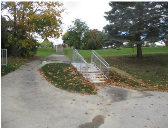
Photo #9- The contractor was advised to wash and clean all the work areas and send photo to our office for review.