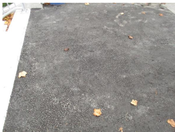
Photo #6- Asphalt surface segregation and cracked/settlement was noted at locations 3 and 4, asphalt areas are to be repaired, photos are to be submitted to our office after repair of asphalt at both locations.