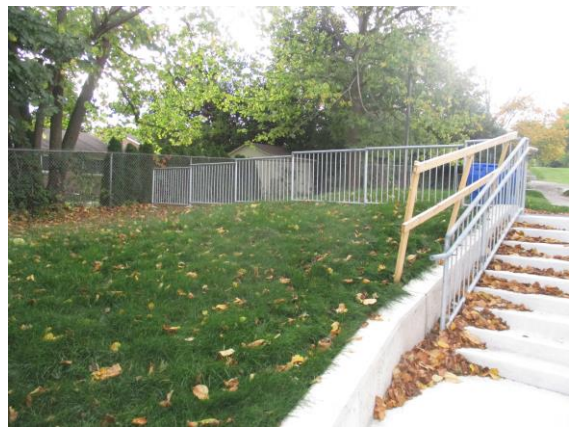
Photo #4- Topsoil and sod for green zone areas adjacent to the stairs were in place.